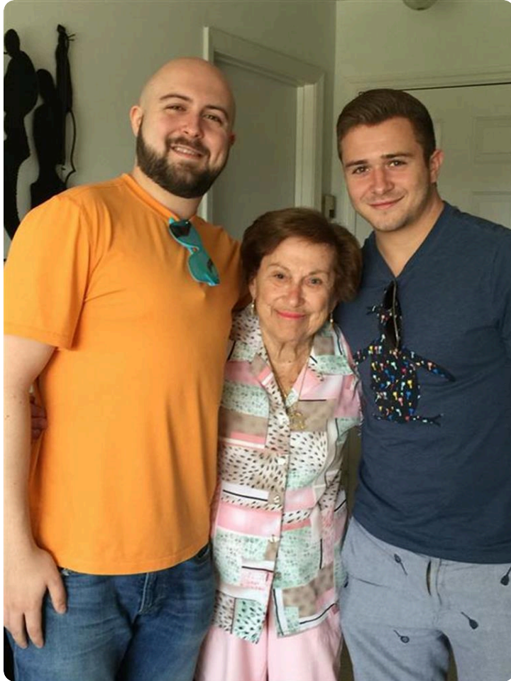
Grandma & Grandsons